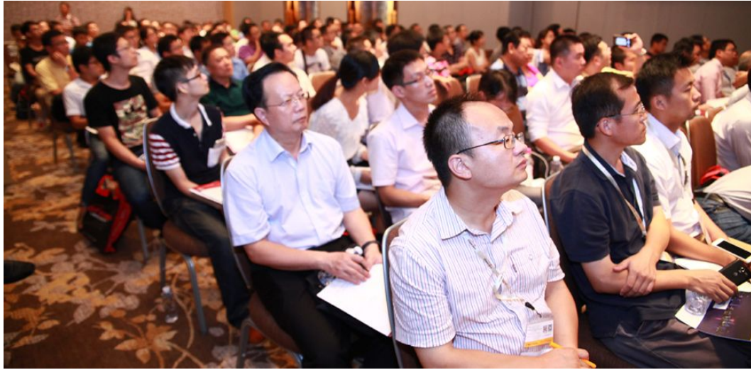
会议现场座无虚席